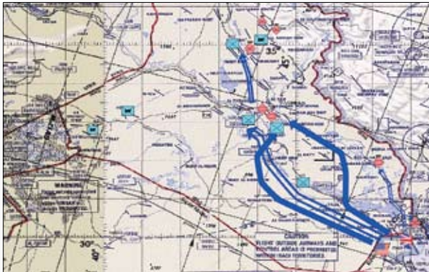
Full MIL-STD-2525B, including MOOTW and custom symbology, and conventional and nontraditional warfare