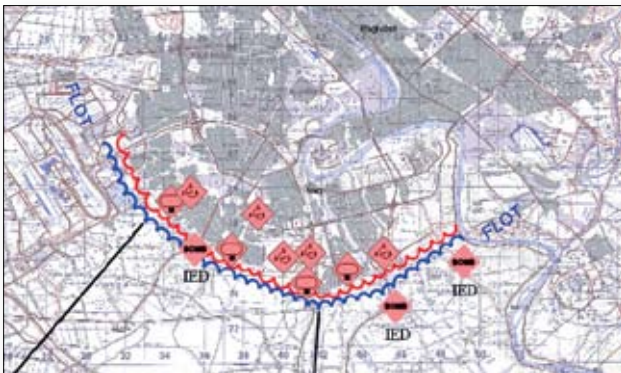
ASAS-L supports OIF before, during, and after the fight

Today, ASAS-Light (ASAS-L) is the premier Army intelligence workstation supporting Operation Iraqi Freedom (OIF). A major reason for this is its success as a planning, visualization, and analysis tool before, during, and after the war in Iraq. ASAS-L is produced by Austin Info Systems, Inc. (AIS).