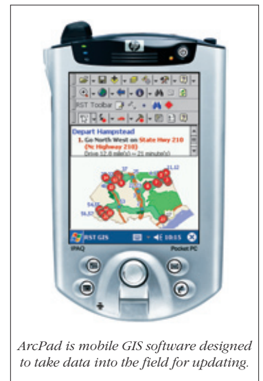
ArcPad is mobile GIS software designed to take data into the field for updating.

The assessment team was outfitted with 10 Hewlett-Packard iPAQs running ArcPad and the ArcPad StreetMap™ extension, which provides a street data network for routing with driving directions. Training with ArcPad was minimal, taking less than three hours.