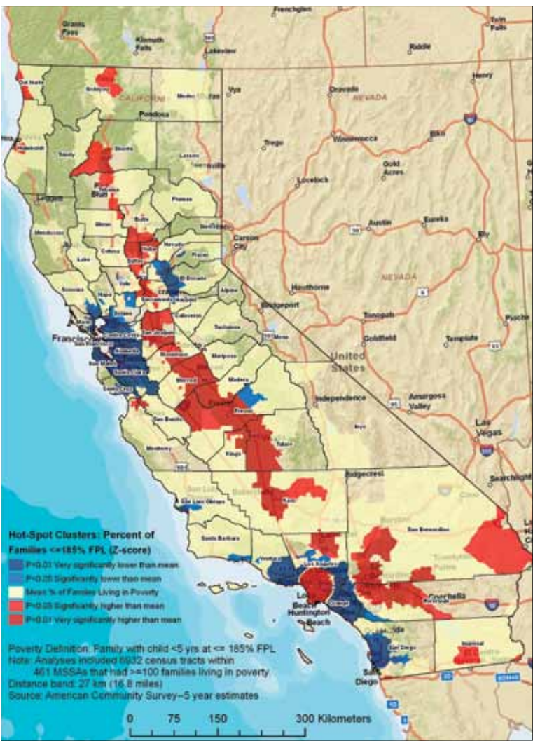
Areas of California are shown with the density of families living in poverty.

For more information, visit cdph.ca.gov/programs/wicworks .