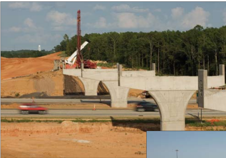
Querying the Texas Historic Overlay prior to any major highway construction or reconstruction project allows TxDOT and its consultants to ensure the preservation of historical and cultural resources.

Understanding Map Projections and Coordinate Systems and Georeferencing Rasters in ArcGIS , both Web courses, are available from www.esri.com/training .