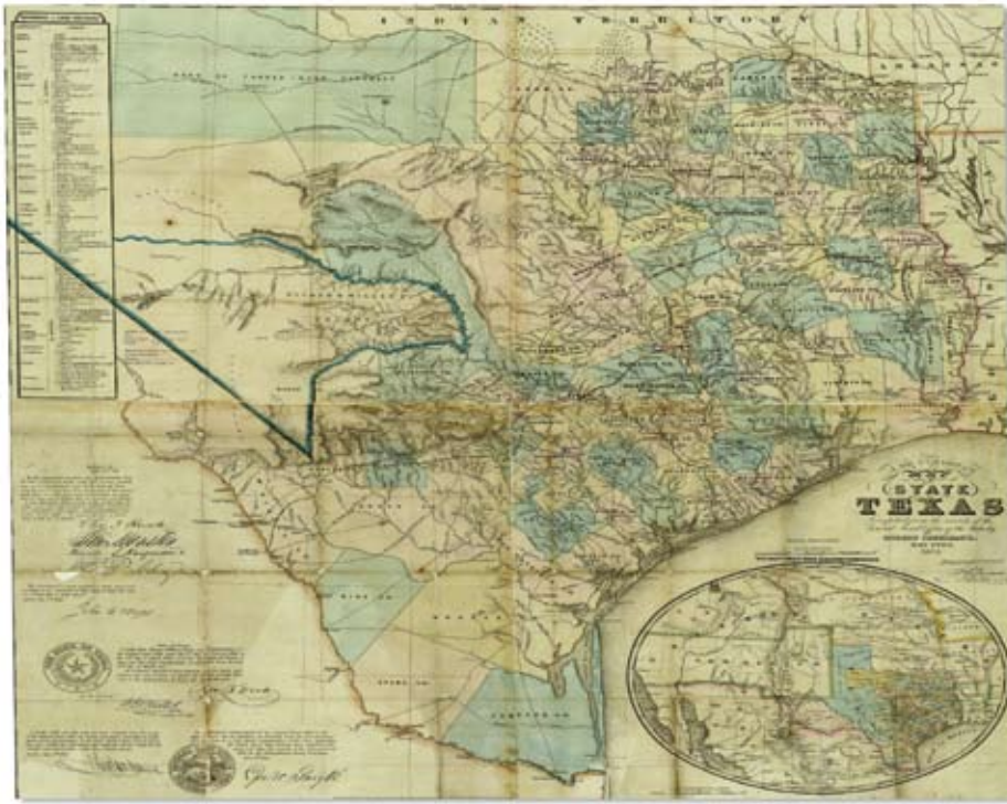
For more than two years, the THO team solicited information from libraries, museums, and repositories and obtained maps. Maps were supplied in a variety of formats including scanned hard copies, photographic reprints, microfilm, digital photography, and tracings of hard-copy maps on vellum.

the 1810–1820 War for Mexican Independence are buried at the church along with the remains of the defenders of the Alamo. The Main Plaza also links to the historic San Fernando Cathedral and the nearby San Antonio River.