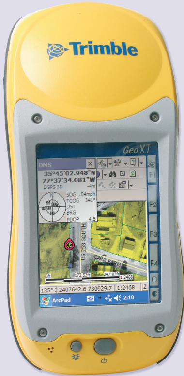
A GPS cursor shows the user's current position while collecting data.

Cut Field-Mapping Time in Half Using Mobile GIS