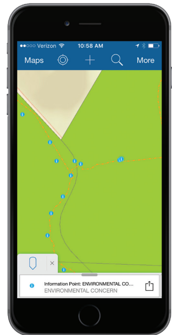
Access to pipelines requires accurate rights-of-way data collection in the field.

Gulfport Energy used the Collector for ArcGIS app to identify suitable pad site locations as well as locating rights-of-way for above ground water pipelines. Collector—chosen for its map-centric workflow and ease of use for existing field crews—enables Gulfport to view and edit possible pad site locations to select the most suitable location. Collector helped to eliminate costly return trips to verify office analysis. Collector was also used in the waterline route planning to help secure rights-of-way while in the field. They now have more accurate data, have gained efficiencies in field workflows and are providing up-to-date pad site and rights-of-way maps that can be easily viewed and shared across departments.