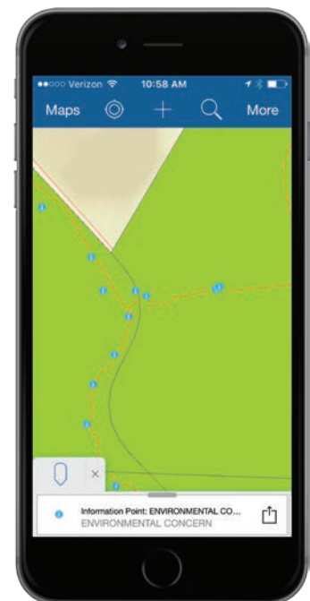
Access to pipelines requires accurate rights-of-way data collection in the field.

Gulfport Energy used the Collector for ArcGIS app to identify suitable pad site locations as well as locating rights-of-way for above ground water pipelines. Collector—chosen for its map-centric workflow and ease of use for existing field crews—enables Gulfport to view and edit possible pad site locations to select the most suitable location. Collector helped to eliminate costly return trips to verify office analysis. Collector was also used in the waterline route planning to help secure rights-of-way while in the field. They now have more accurate data, have gained efficiencies in field workflows and are providing up-to-date pad site and rights-of-way maps that can be easily viewed and shared across departments.