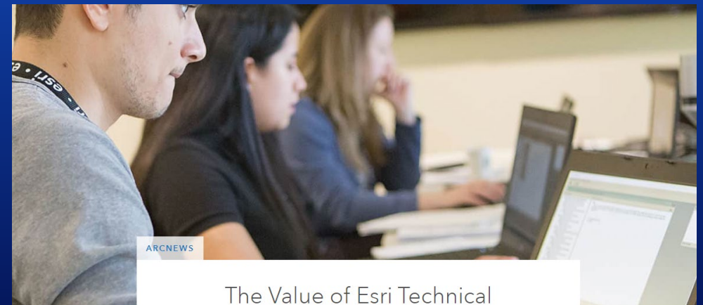
ARCNEWS The Value of Esri Technical Certifications, Supported Organizationally