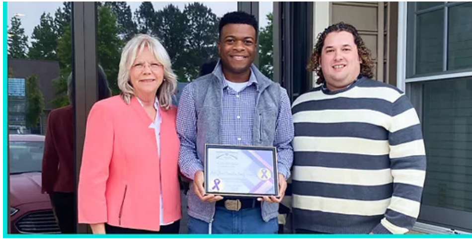
The Mid-Shore Council on Family Violence wins Domestic Shelters Purple Ribbon Award for their innovative use of GIS.