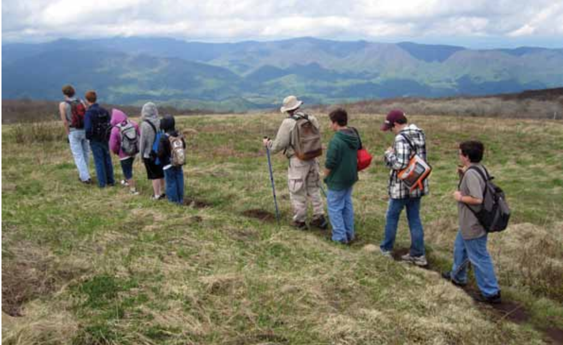
Clockwise from far right: A detailed, local A.T. brochure was created to help day hikers get out and enjoy the Trail; The completed map, created with an advanced GIS mapping program called ArcGIS, highlights local sections of the Trail; Saving the best section for last during a hike along the 5,516-foot-high peak of Big Bald with 360-degree views of Unicoi County.