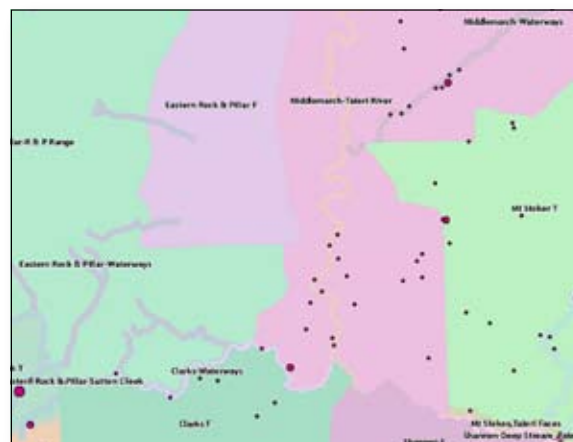
ArcGIS allows AHB to share information about the locations and quantity of possum captures as part of its vector control programs.

The major cause of TB in cattle and deer herds in New Zealand is contact with wild vectors, mainly the introduced Australian brush-tailed possum. Intensive, large scale possum control programmes are therefore needed to prevent transmission of TB from possums to livestock.