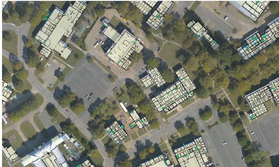
LaRC first floor building interior detail superimposed on an aerial photograph. Bringing in just the first floor plans for the buildings is too dense at full extents of the map for staff to use the information effectively.

GIS for LaRC was born more than two decades ago out of an anticipated need to address facility planning more efficiently and effectively by capturing corporate knowledge into configuration management and decision support systems. Integration of datasets was seen as a key method to ensure sustainable data maintenance. Integration efforts include support to master plan, real property, utility system, environmental, facility full cost, maintenance, personnel, and space utilization functions. A primary goal was to cultivate and manage the most stringent data that was available, reducing the number of datasets and encouraging data use in order to simplify maintenance by multiple users.