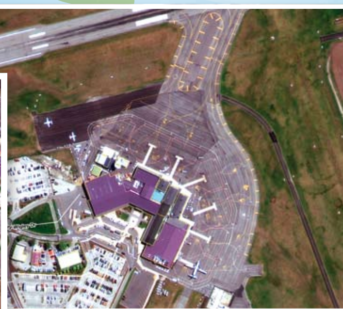
The advanced image display uses hardware and software rendering for fast and seamless exploration.