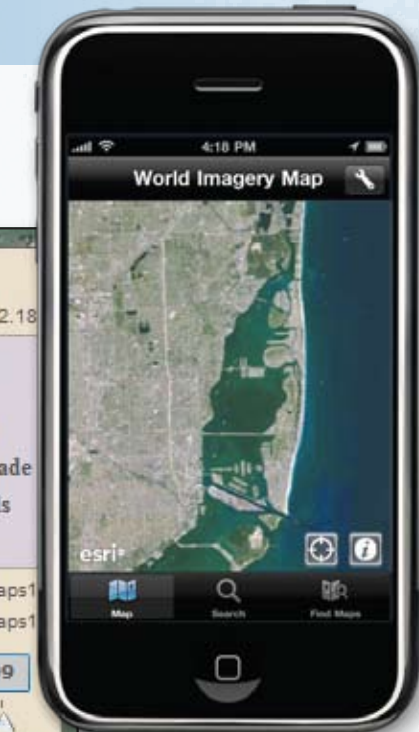
Quickly and easily get imagery to those who need it, wherever they need it.