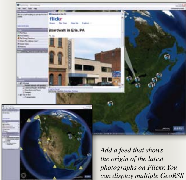
Add a feed that shows the origin of the latest photographs on Flickr. You can display multiple GeoRSS feeds in a single ArcGIS Explorer document.

To add a GeoRSS feed, start ArcGIS Explorer and choose File > Open . Click Servers in the sidebar. Click GeoRSS Feed and type in the feed URL.