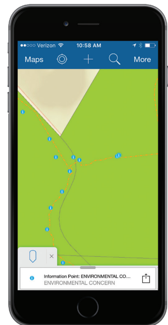
Access to pipelines requires accurate rights-of-way data collection in the field.

Gulfport Energy used the Collector for ArcGIS app to identify suitable pad site locations as well as locating rights-of-way for above ground water pipelines. Collector—chosen for its map-centric workflow and ease of use for existing field crews—enables Gulfport to view and edit possible pad site locations to select the most suitable location. Collector helped to eliminate costly return trips to verify office analysis. Collector was also used in the waterline route planning to help secure rights-of-way while in the field. They now have more accurate data, have gained efficiencies in field workflows and are providing up-to-date pad site and rights-of-way maps that can be easily viewed and shared across departments.