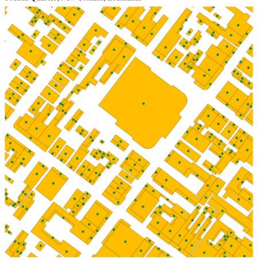
Figure 3 Digital Sanborn Building Footprints, French Opera House Circa 1885, French Quarter, New Orleans, Louisiana.

Floor text information: Information pertaining to sub- and superstructures interpreted from the map. It includes basement, subbasement, and attic.