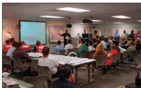
Daily briefings inside the Santa Barbara County Emergency Operations Center relied heavily on GIS data and GIS-based maps to show the march of the Zaca fire toward cities and the firefighters' efforts to put containment lines around it.

Information about the locations of utility infrastructure—such as power lines, electricity towers, water lines, and gas valves—was also incorporated into the GIS database. Firefighters wanted to be