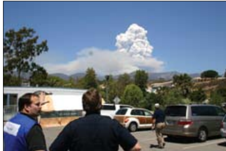
A giant "Pyro Ice Cloud" rises above the distant mountains as the Zaca fire burns uncontrolled about 25 miles away from Santa Barbara County's Emergency Operations Center and media briefing tent (foreground). The spectacle of Pyro Ice Clouds was a common occurrence caused by huge amounts of water vapor being released into the atmosphere during intense burns of trees and other vegetation.

One of the more complex undertakings involved generating a comprehensive evacuation plan for the cities of Santa Barbara, Goleta, and Carpinteria, as well as adjacent communities such as Montecito. Officials were concerned the wildfire would jump containment lines and race over the Santa Ynez Mountains into the coastal areas. The federal-state-county incident management team used GIS to create digital maps and contingency plans for a comprehensive GIS-based plan dubbed The Santa Barbara County Front Country Contingency Plan. The plan was developed for evacuating more than 100,000 residents in Santa Barbara County, if necessary.